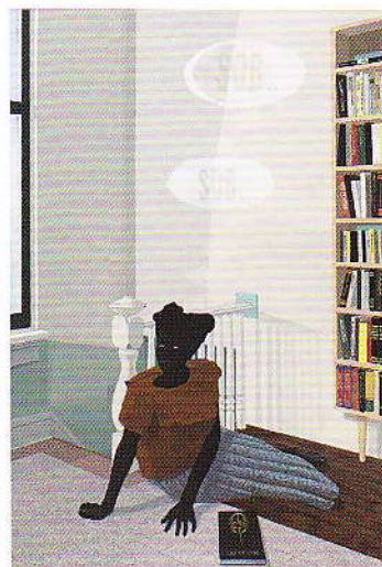
Kerry James Marshall, SOB, SOB, 2003. Acrylic on fiberglass. Smithsonian American Art Museum, Museum purchase through the Luisita L. and Franz H. Denghausen Endowment

seek to foster a cross-cultural dialogue about the history of art of the United States up to 1980. They support work by scholars from abroad who are researching American art or by U.S. scholars who are investigating international contexts for American art.